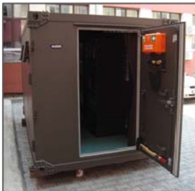
AUDIO PROCESSING STATION