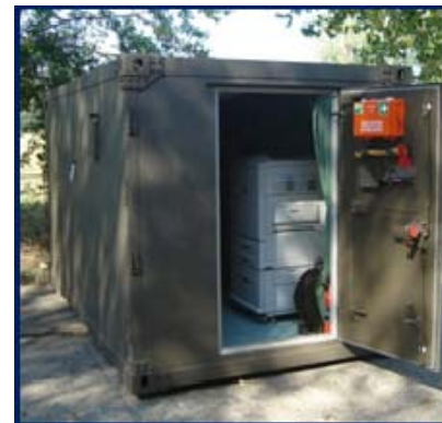
VIDEO PROCESSING STATION